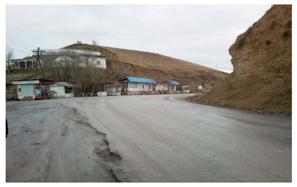
APPENDIX 1: PHOTOGRAPHS OF CONDITION OF NOOKAT PASS PEAK