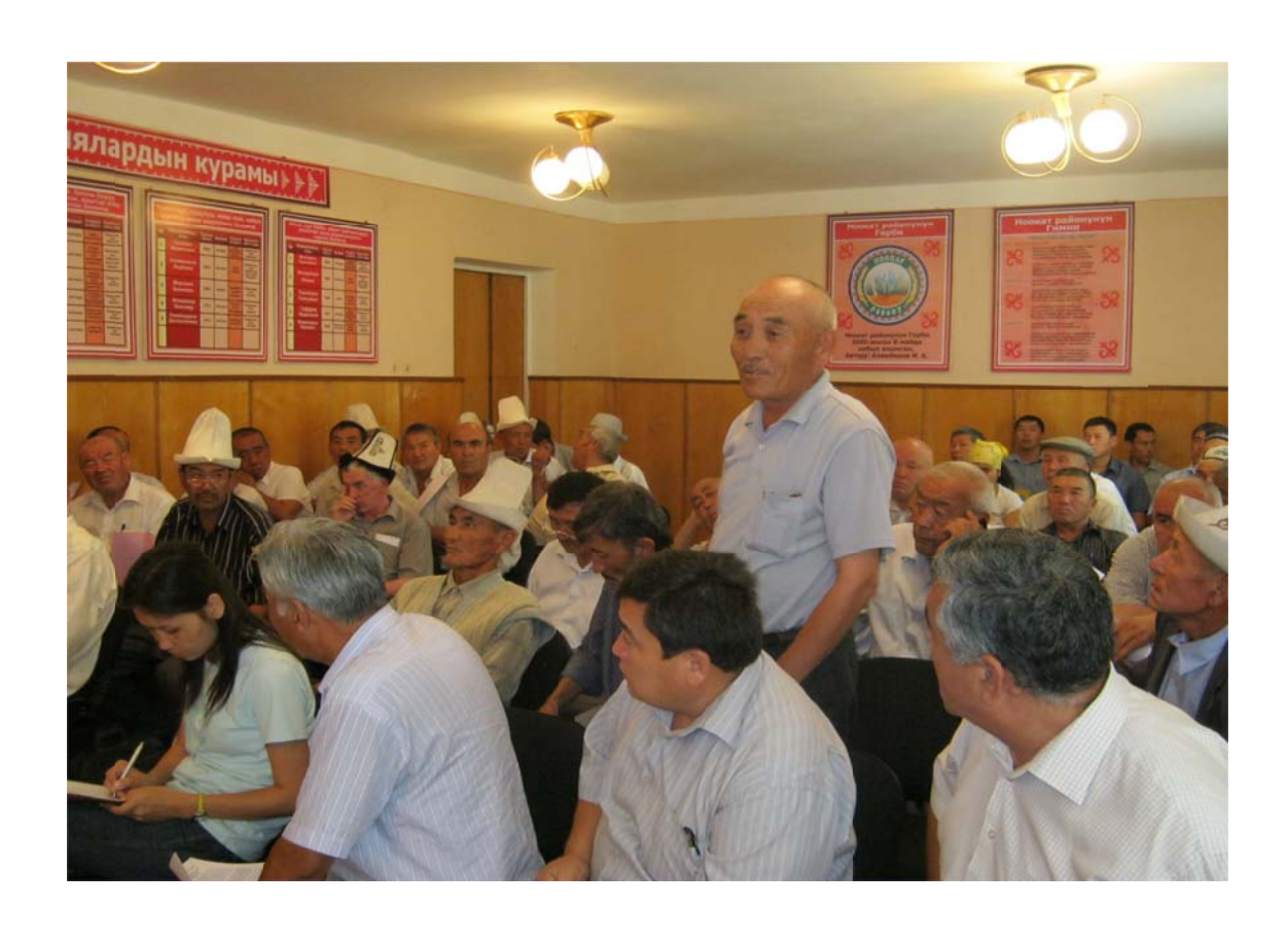
February 29, 2012 / Osor village (Zulpuevskiy aiyl okmotu)