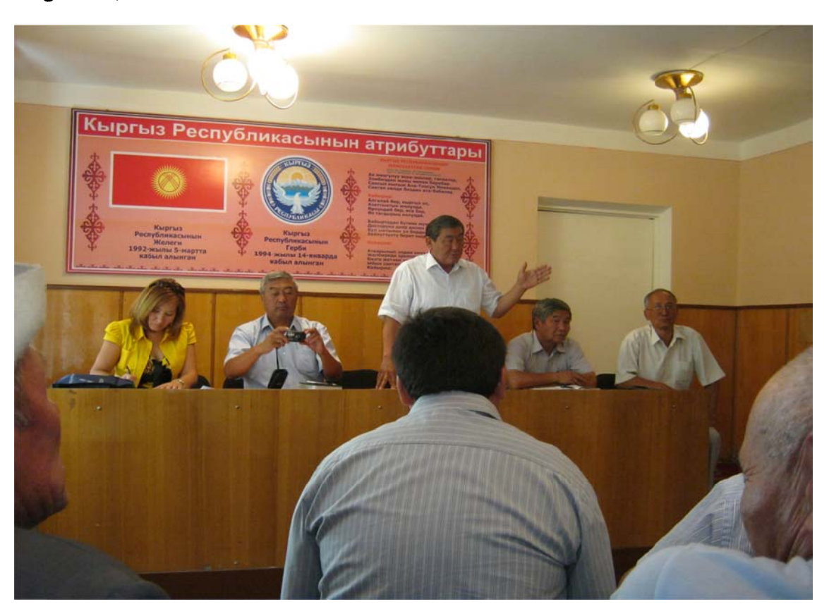
August 26, 2011 / Nookat town