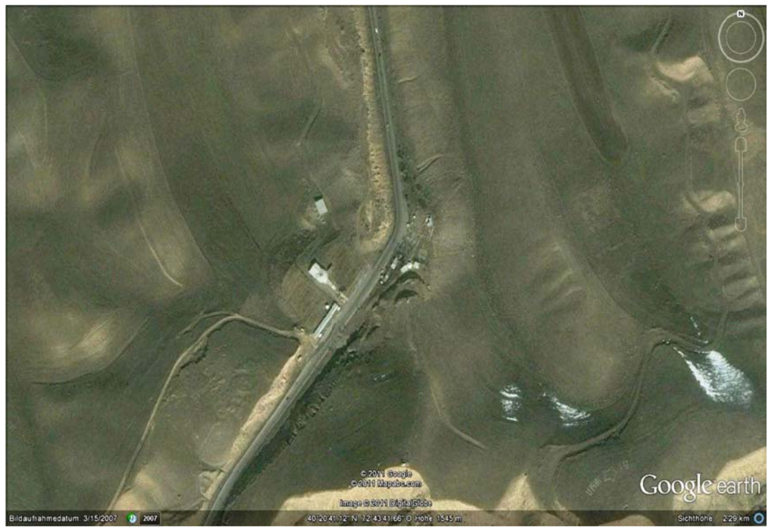
Figure 1: Aerial photograph of Nookat Pass peak with buildings

km22+550 to km25+550 has a longitudinal slope of up to about 8% and the horizontal alignment features a number of radii the smallest being located just in front of the peak point (see Figure 1 below).