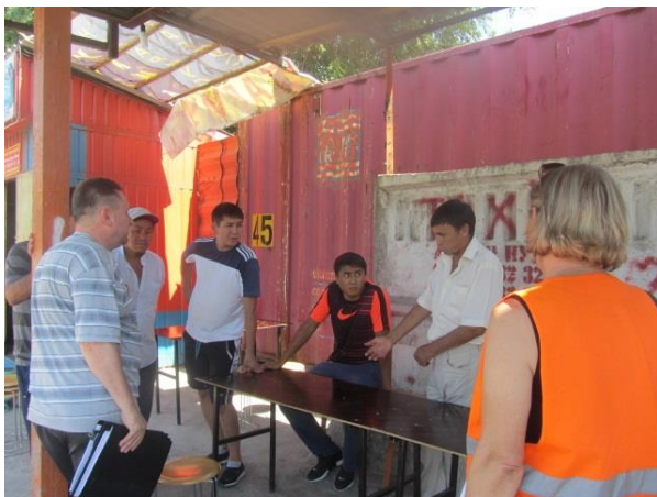
Random checking business owners for container relocations