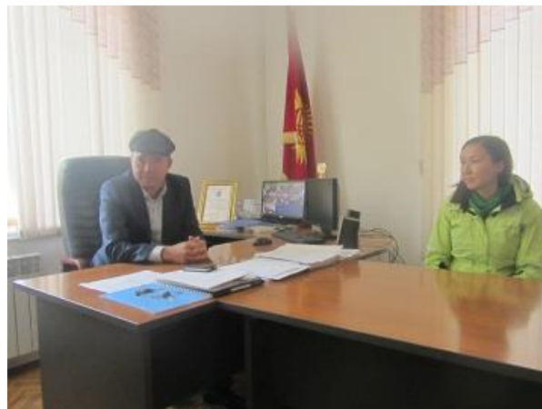
Briefing the Head of Ayil Okmotu