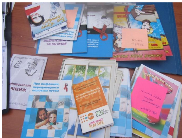
HIV prevention handouts