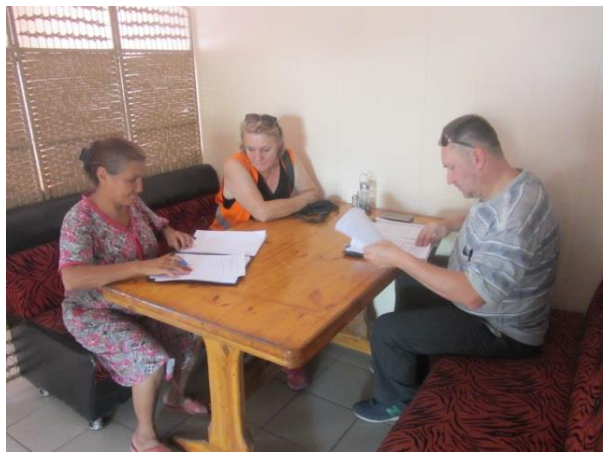
Signing an agreement for the container relocation