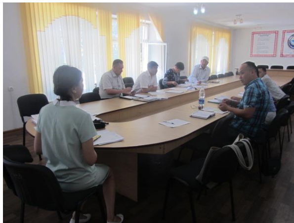
GRG Moskovskiy Rayon