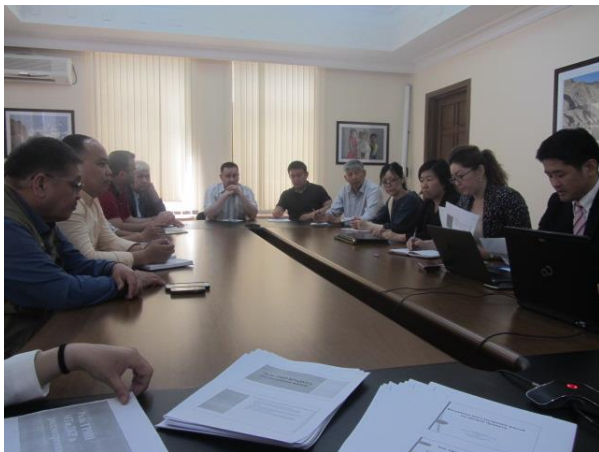
ADB RM Session on GRM

31. The second round of trainings for members of the established Grievance Redress Groups at the local level, was conducted on 22 June 2017 in each of the three Project Rayons. There were 17 members of the GRGs from Sokoluk, Moskovskiy and Jailskiy rayons. Each session with the question time, lasted for 2 hours. All three specialists, Eptisa's National and International Consultants and the IPIG Social Safeguard Specialist, presented jointly the GRM procedure related to the field level grievance redress mechanism. The GRG members in Jail expressed their wish to practice the completion of the template forms. Consequently, a role play activity was held, and the GRG members had a chance to record a 'complaint', explain the redress procedure to the 'complainant', solve the issue and register it in a cumulative logbook. (Please see the photographs below)