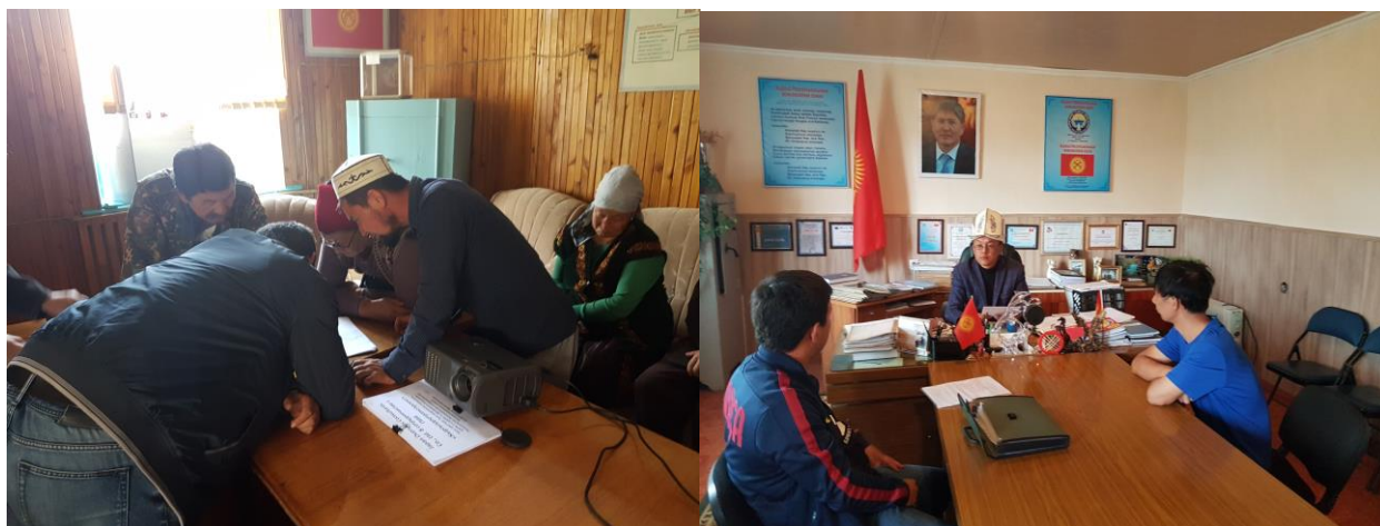
Trainings and meetings with representatives of local authorities

30. IPIG activated and trained Grievance Redress Groups at the local level. IPIG updated the Project Information Brochure and the GRM and ensures that all GRG focal persons are trained and ready. The first round of trainings for members of the established Grievance Redress Groups at the local level, was conducted on 4 July 2019 in each rural district. There were 8 members of the GRGs from Jungal, Jany-Aryk, Kuiruchuk and Tugol-Sai rural districts. Each session with the question time, lasted for 1-2 hours. The Gentek national resettlement consultant and the IPIG social safeguard specialist, presented jointly the GRM procedure related to the field level grievance redress mechanism. All participants received presentation handouts, the project information brochure with the updated list of GRG members, template forms and necessary information on GRM procedures.