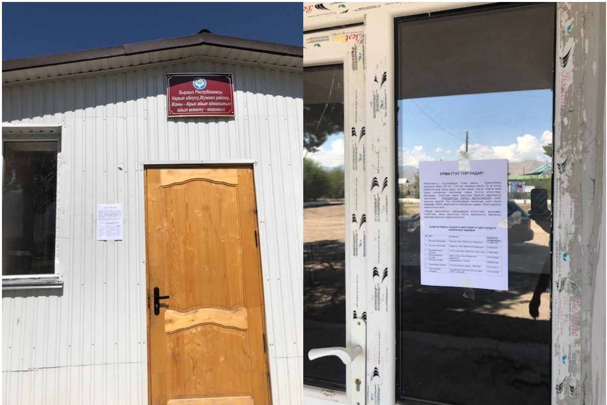
Placement of information brochures with local contact persons