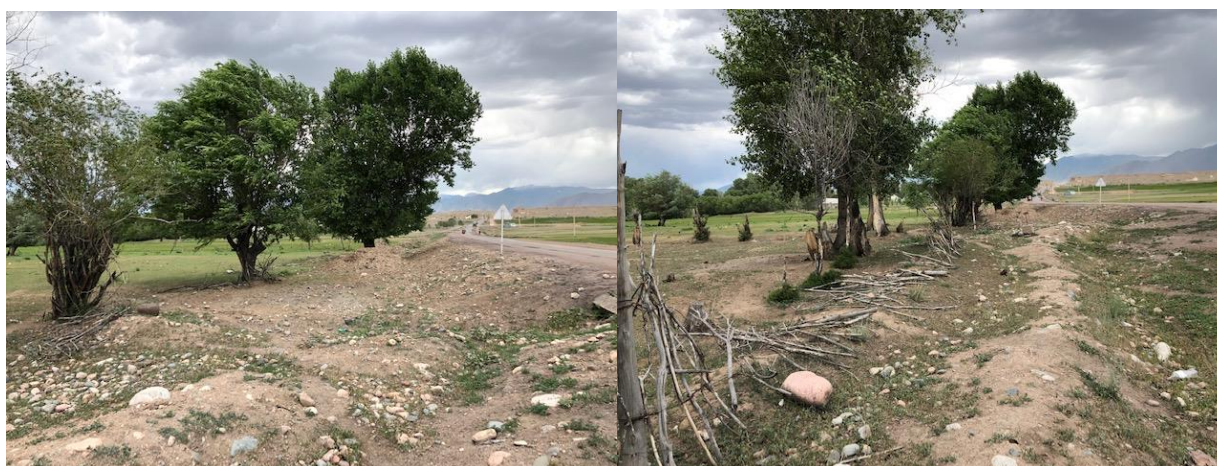
Land plot and fence of dry twigs at km 150+000