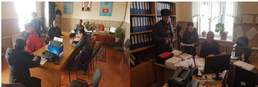
Work with representatives of the Gosregister and local authorities