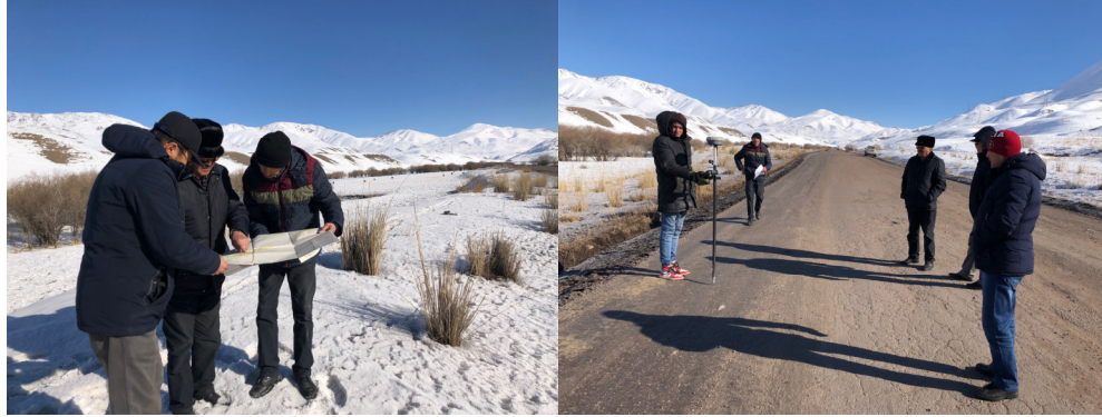
Discussions with representatives of local authorities, Gosregister and engineers