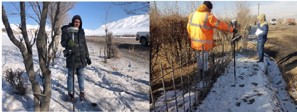
Clarification of objects and AP's, work with engineers, representatives of local authorities and Gosregister