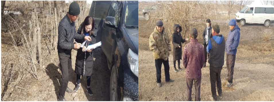
Meetings with APs and members of local communities