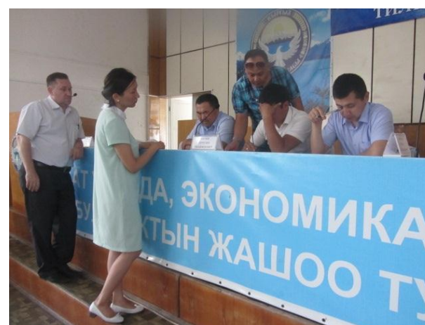
Role play, GRG Jail