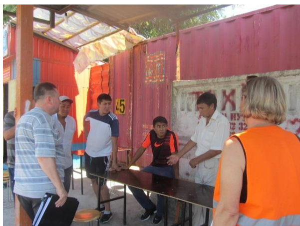
Random checking business owners for container relocations

23. The IPIG Chief Architect will assist local authorities where needed. He will also collect copies of the owners' agreements which will be kept for the records. The copies of DPs' agreements will be attached as an annex to the next Social Monitoring Quarterly Report.