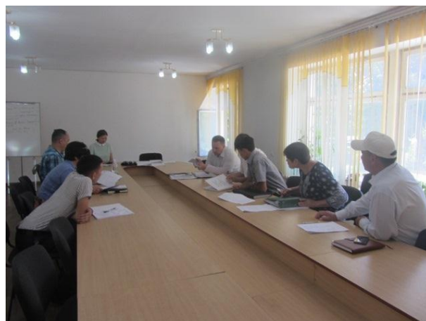
GRG Moskovskiy Rayon