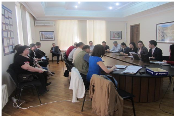
Joined Session on GRM

24. The Grievance Redress Mechanism for this Project was established during the preparation of the LARP. As the Project implementation has started, there was a need to re-activate GRG members at all levels and train them in tasks related to the LARP and the Project implementation. A session on the Resettlement Safeguard for the Grievance Redress Group (GRG) members, GRG Focal Points, the line departments, supervision consultant, contractor and NGOs, was conducted in Bishkek on 10 May 2017. The session was organized and jointly conducted by ADB Consultants, Eptisa's Consultants and the IPIG Social Safeguard Specialist. There were 15 participants at this GRM session.